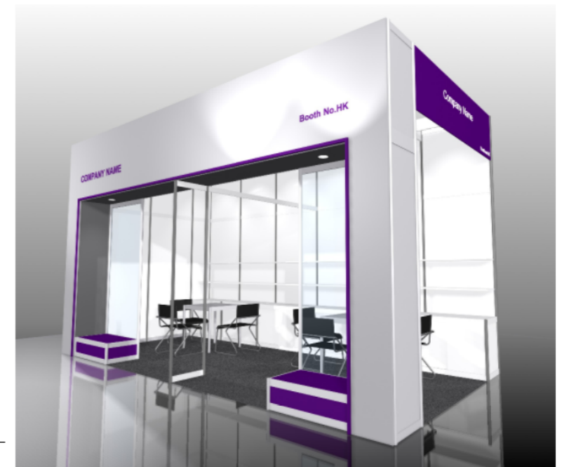
COLOUR PERSPECTIVE N.T.S.